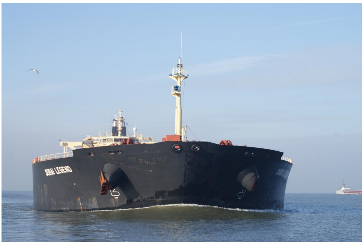
Figure 3 (Below). The high bow pressure (bow wave) can clearly be seen at the bow of the loaded bulk carrier.